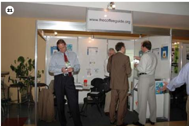
ITC Geneve - United Nations