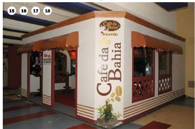
Secretariat of Agriculture, Irrigation and Agrarian Reform of Bahia State