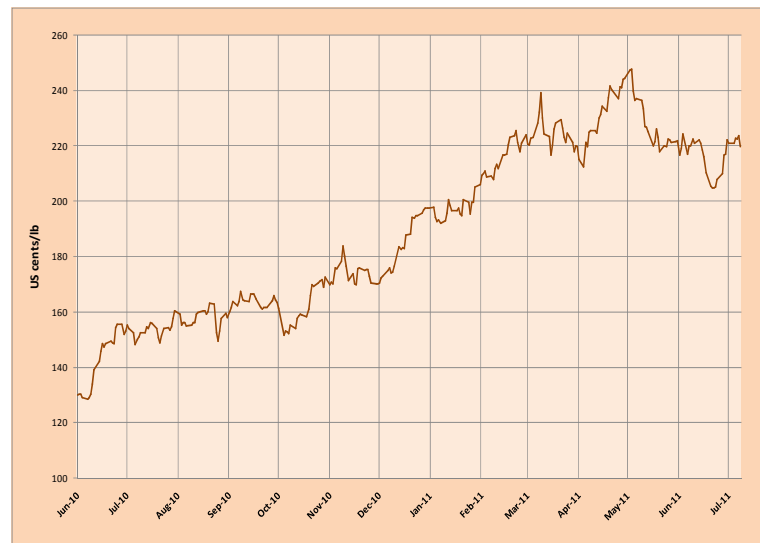
Graph 1: ICO composite indicator prices Daily: 1 June 2010 to 11 July 2011