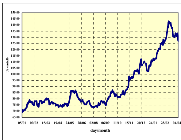
Graph 2: Daily indicator prices for Colombian Milds, 5 January 2004 – 8 April 2005